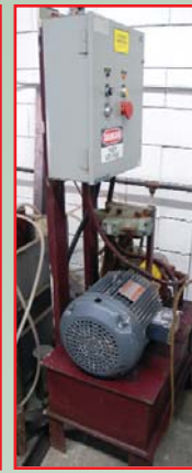
LINCOLN ELECTRIC 5 HP HYDRAULIC PUMP