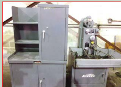
SUNNEN HONE MODEL MBB-1660K

Behind each Infinity appraisal stands over 3 decades of industrial knowledge and expertise. Let our CPPA certified appraisers conduct your next appraisal. Call us in complete confidence at 905-669-8893