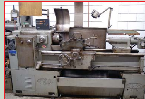
FIMAP MODEL PT22, 20" X 48" LATHE