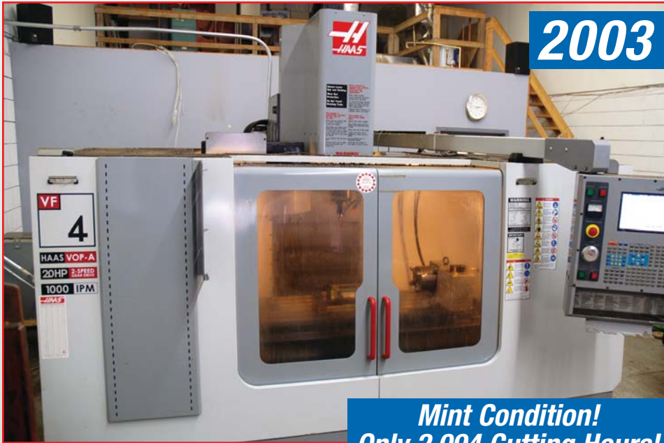
HAAS CNC VERTICAL MACHINING CENTER, MODEL VF4B

Precision HAAS CNC Machining Facility 4401 Corporate Drive, Unit #4, Burlington, Ontario, Canada