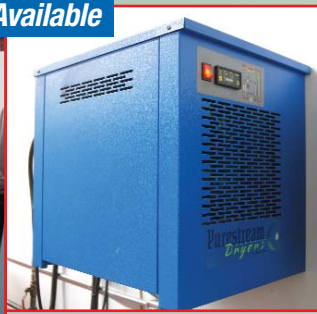
FRIULAIR AIR DRYER MODEL DFE8/AC DEVAIR 10 HP UPRIGHT AIR COMPRESSOR