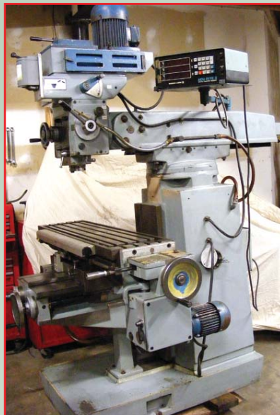
PRVOMAJSKA VERTICAL MILL, MODEL G301D