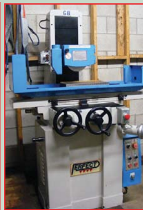
PERFECT MODEL PFG-2040M MANUAL SURFACE GRINDER