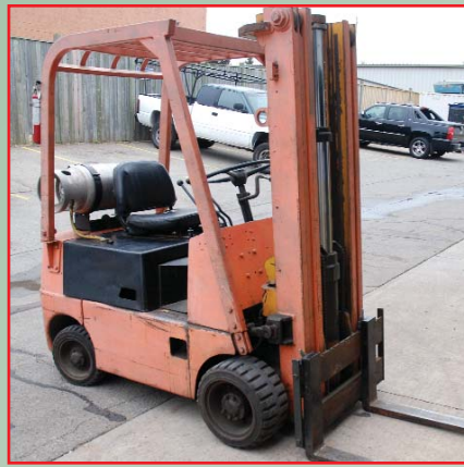
TOYOTA 5,000 LB CAPACITY PROPANE FORKLIFT