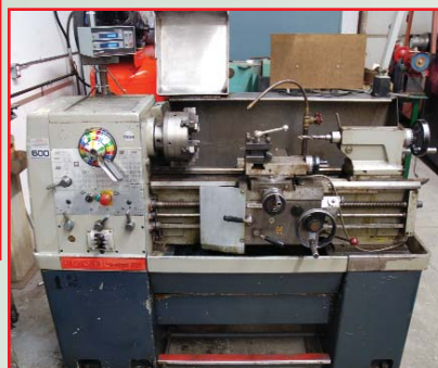
COLCHESTER STUDENT 1800, 14" X 24" LATHE

COLCHESTER Model Student 1800, 14" x 24", 8" 6 Jaw Chuck, 1.5" Bore, Tailstock, Acu-Rite 2 Axis DRO, Tool Post, Foot Brake