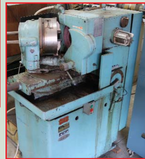
OLIVER TOOL GRINDER MODEL 600