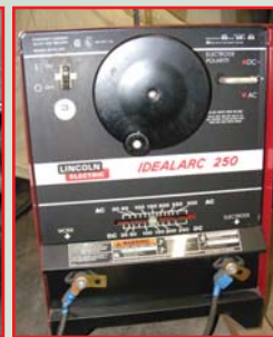
LINCOLN IDEALARC 250 STICK WELDER

CAN'T ATTEND AUCTION? ALSO BID ONLINE VIA