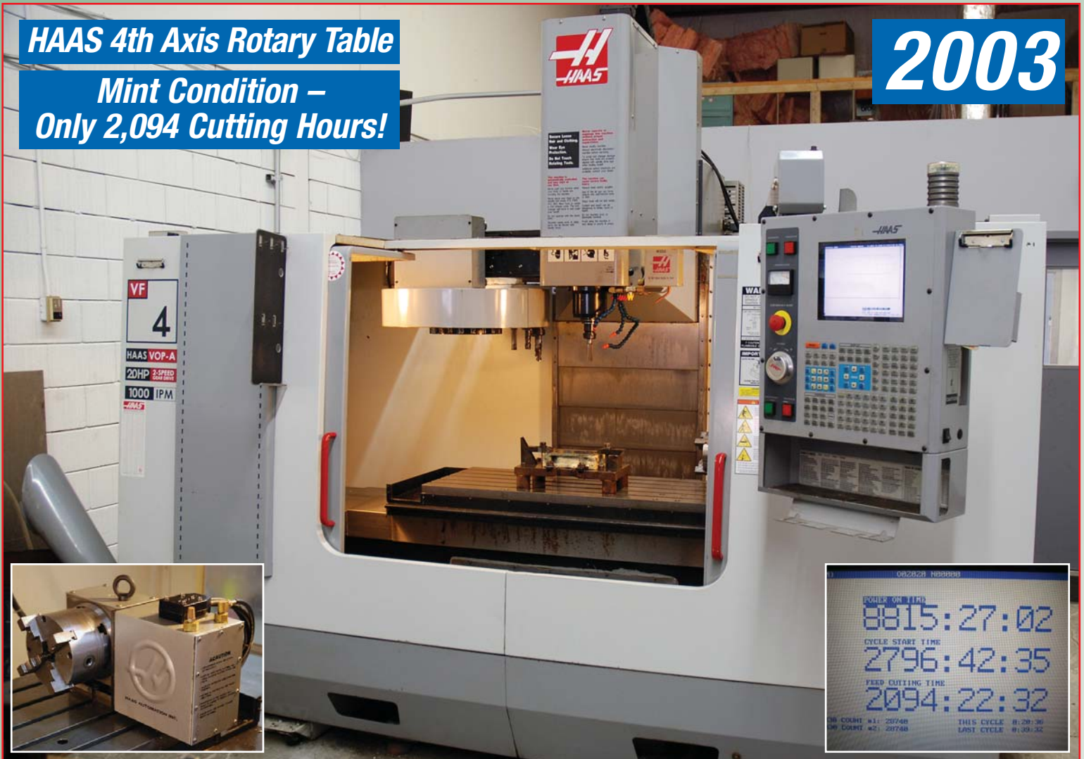
HAAS CNC VERTICAL MACHINING CENTER, MODEL VF4B