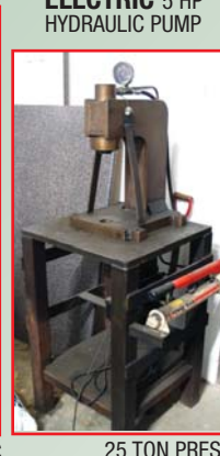
25 TON PRESS