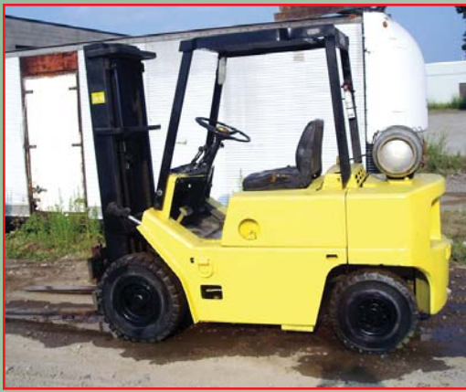
CLARK 5,000 LB CAPACITY PROPANE FORKLIFT