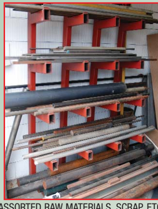
PARTIAL VIEW ASSORTED RAW MATERIALS, SCRAP, ETC.