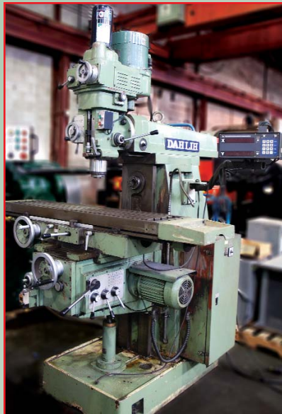
DAHLI UNIVERSAL MILL, MODEL DL-GH950