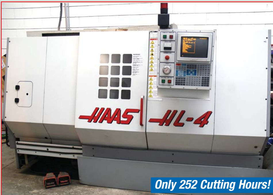
HAAS CNC LATHE, MODEL HL4