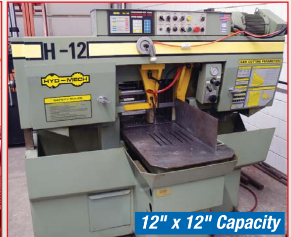
HYD-MECH MODEL H-12A AUTOMATIC HORIZONTAL BANDSAW