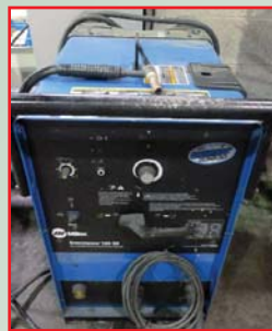
MILLER SYNCROWAVE 180SD TIG WELDER

Complete Sheet Metal and HVAC Fabrication Facility 30 Intermodal Drive, Unit #36, Brampton, Ontario